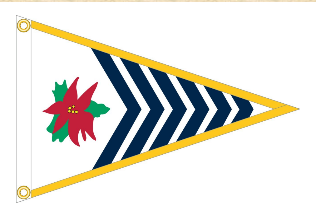
12" by 18" Burgee Price 26.00