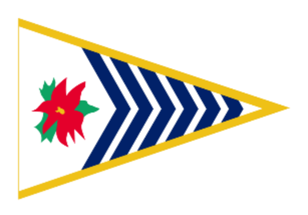
4" Burgee Decal 1.00